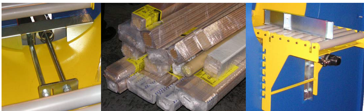
Easy Wrap™ FV205 Semi automatic vertical wrapping machine