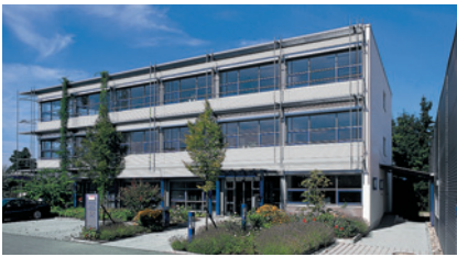
Development centre in Germany