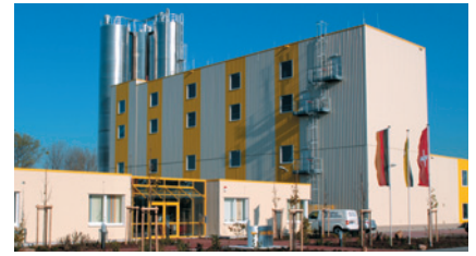
Polyester recycling plant in Germany