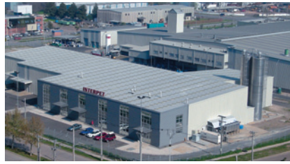
Productions centre for STARstrap™ strapping in Chile