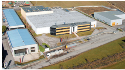
Production centre for machines and equipment in Italy