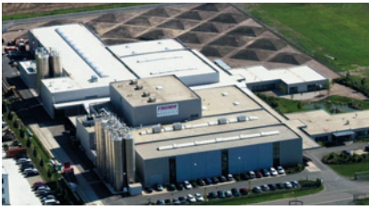
Productions centre for STARstrap™ strapping in Germany