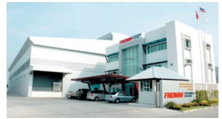
Production centre for STARstrap™ strapping in Thailand