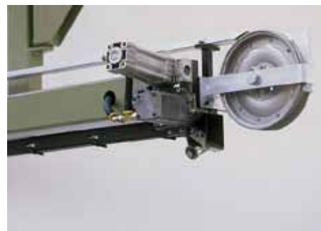
Strap feeding unit E 101