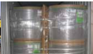
Pulp & Paper