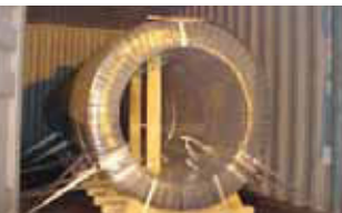
Steel & Metal