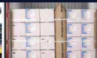
Transport & Logistics