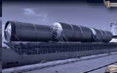
Fast to apply

ep cordstrap Your partner in cargo securing systems!