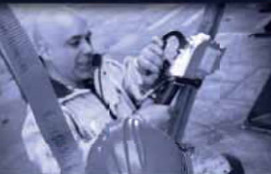
Safe for user & receiver