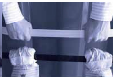
Strong as steel