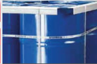
SAFE FOR USER & RECEIVER