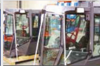
PREVENTS PRODUCT DAMAGE