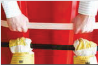
AS STRONG AS STEEL