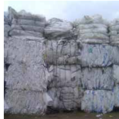
Neat high-density plastic bales

International Cargo-Line Sweden AB is a family-owned business started in 1988. "We recycle any type of plastic" is the business concept and Cargo-Line focuses mainly on large manufacturing industries and municipalities. The services include recycling, trade and transport of plastic and approximately 50 % of the material is exported.