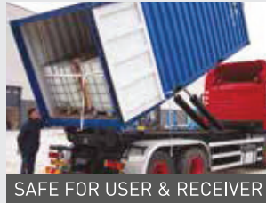
SAFE FOR USER & RECEIVER