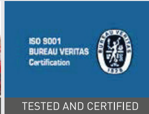
TESTED AND CERTIFIED